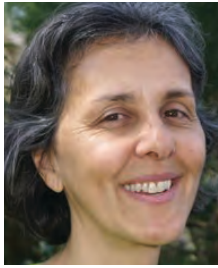
By Babs Vitale, RN, HNC

I recently started a new nursing position working in a ten day critical intervention post detox recovery program for women. My clients are all shapes and sizes, creeds and colors, ages and persuasions, and above all, they are in different stages of Healing. This is a population with which I am not unfamiliar, having worked inpatient dual diagnosis programs (mental illness and substance abuse) and in numerous homeless shelters where substance abuse (SA) is a major challenge for my clients.